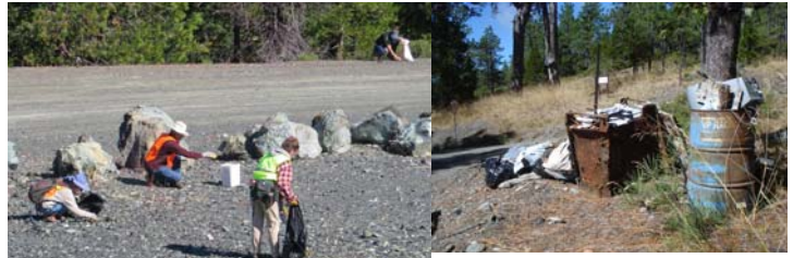
Trash pick up

further down the trail) and spent a couple of hours collecting items left behind by others (mostly from target shooting). The effort was such a success that Six Rivers National Forest folks had to come back and pick up the remainder of piles/bags of trash we collected because they didn't fit into the trucks they had.