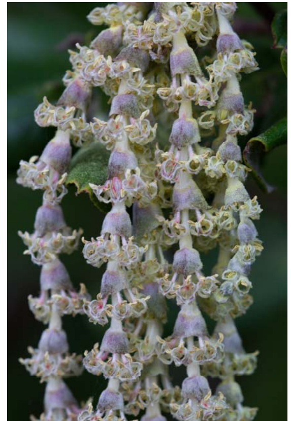
Silk tassel ( Garrya elliptica )

Two shrubs that flower in the winter, silk tassel ( Garrya elliptica ), a broadleaf evergreen, and California hazelnut ( Corylus cornuta ), a deciduous broadleaf, provide color at a time of year when we least expect it. Coastal silk tassel, particularly the selections "James Roof" and "Evie," can produce masses of male