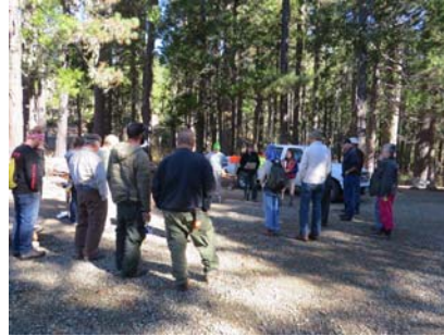
Morning orientation and safety talk

On National Public Lands Day, September 27, the North Coast CNPS teamed up with and co-sponsored a trash clean-up and nature walk with K-S Wild and the Six Rivers National Forest.