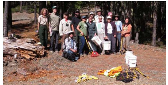
After lunch group photo

We agreed to do this again next year because the locale is special (less than an hour from Arcata, easy access, great views, and incredible plant community), the project