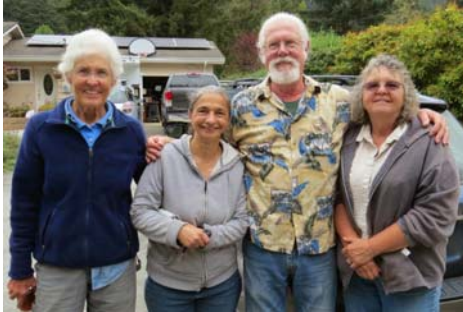
More volunteers than pictured

Thanks to all of the volunteers for the important roles played in making the Redway Project a great success. We had many tasks and many hands made this lovely memorial garden possible.