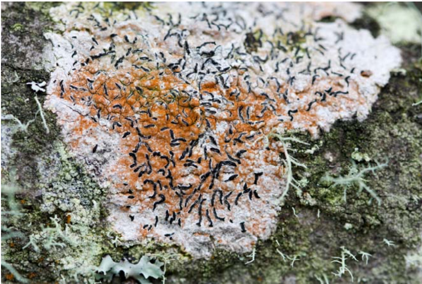
Lichen on red alder ( Alnus rubra )

Along with lichens, other epiphytes like licorice fern ( Polypodium calirhiza ) are at their best in winter. During this time of the year, licorice ferns can fill large areas devoid of vegetation during the summer: once a licorice fern is established, it holds it own against weeds!